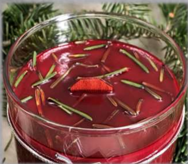
FIR NEEDLE BURGUNDY

All Tureen Jar Candles have lead-free, cotton braid with paper core wicks.