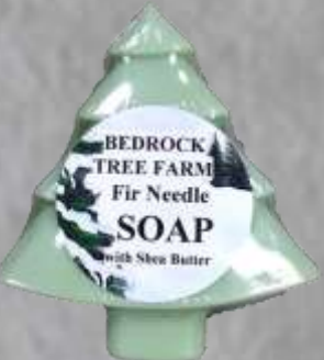
FT102SHEA 2.5 oz.