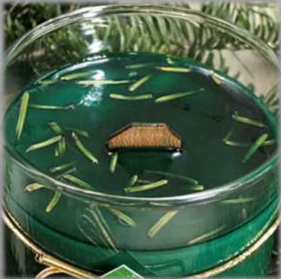
FIR NEEDLE GREEN