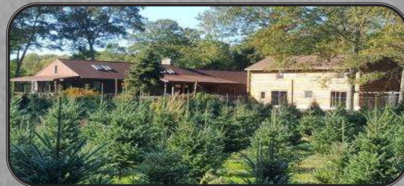
In 2016 Tom built us a magnificent 2,000 square foot, two story log building for our candle and soap making expansion.

(No, none of the foxes in this catalog are photo shopped in or retouched.)