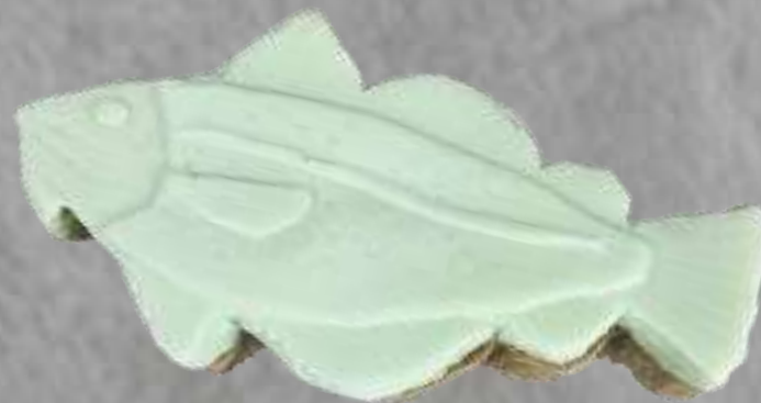
FISH104 Also available on a rope if requested—no charge.

All soaps pictured are Approx. 4oz. And come packaged in a gift box unless otherwise noted. The smaller rectangle is kraft. Large rectangle is white or kraft.