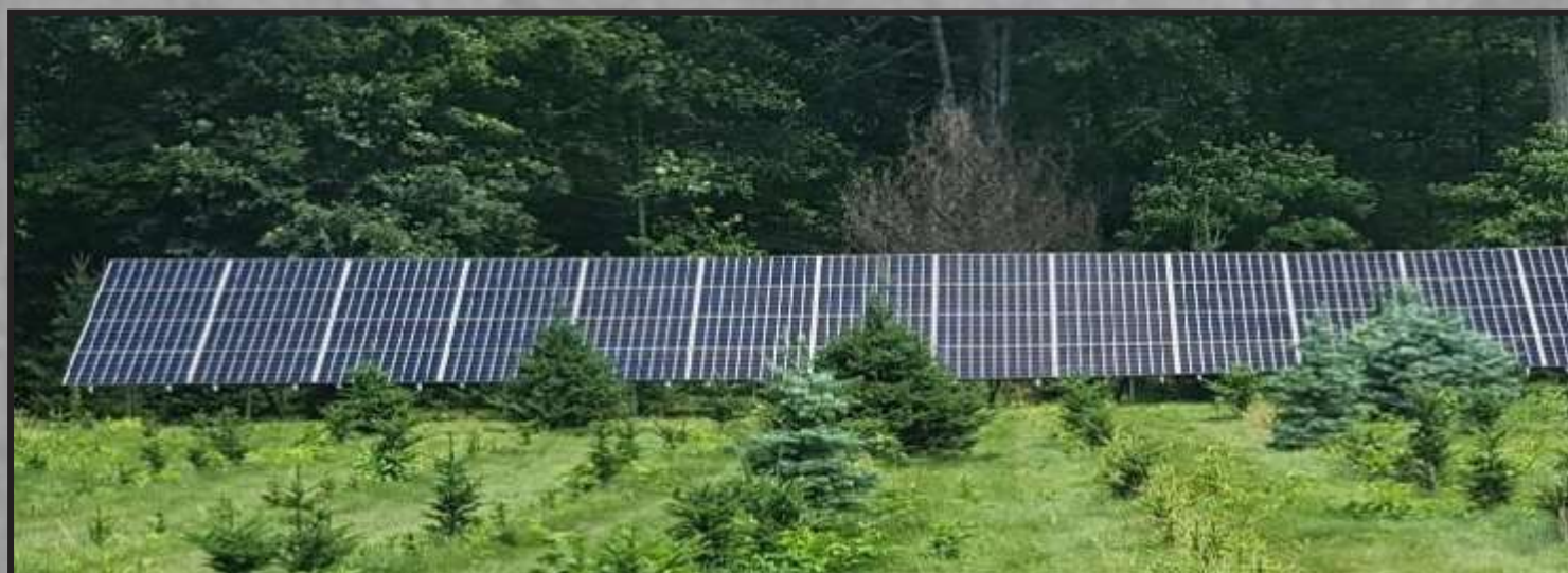
With the help of the USDA, RI DEM, NATIONAL GRID, FARM CREDIT EAST, and others we installed a ground mounted Solar Array 18.56kW(AC) System that was turned on October, 2018. This fully supplies our electrical needs here at Bedrock Tree Farm.