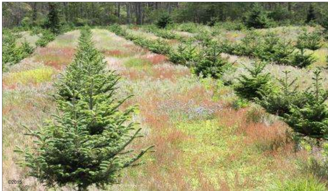
Bluebirds flock the back Fraser field on a warm summer day.