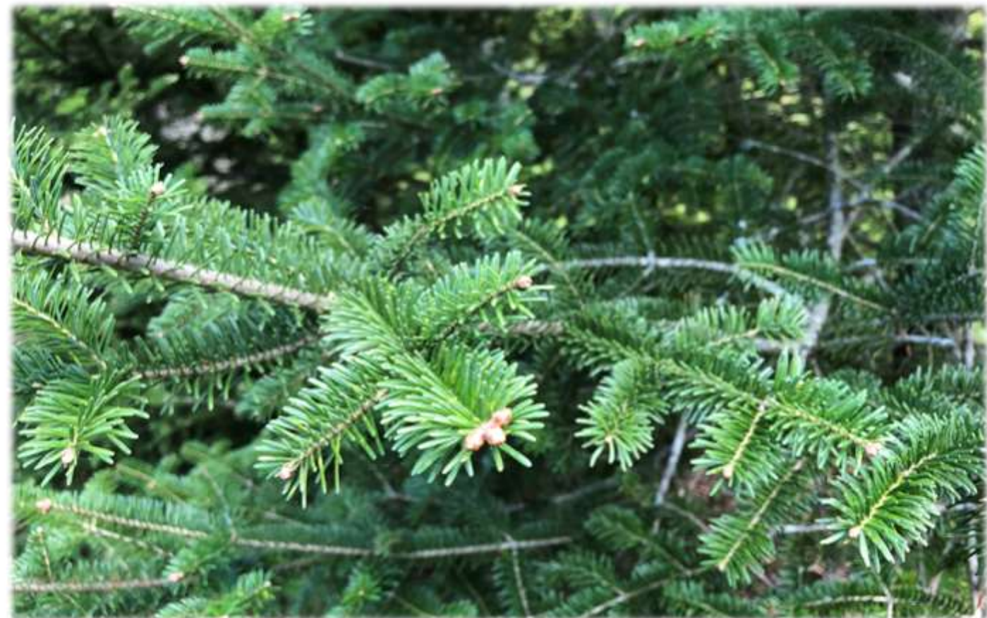
CANAAN FIR ( Balsam/Fraser Hybrid)

We harvest the clippings, dry, grind and blend them into all of our products for that amazing natural true scent.