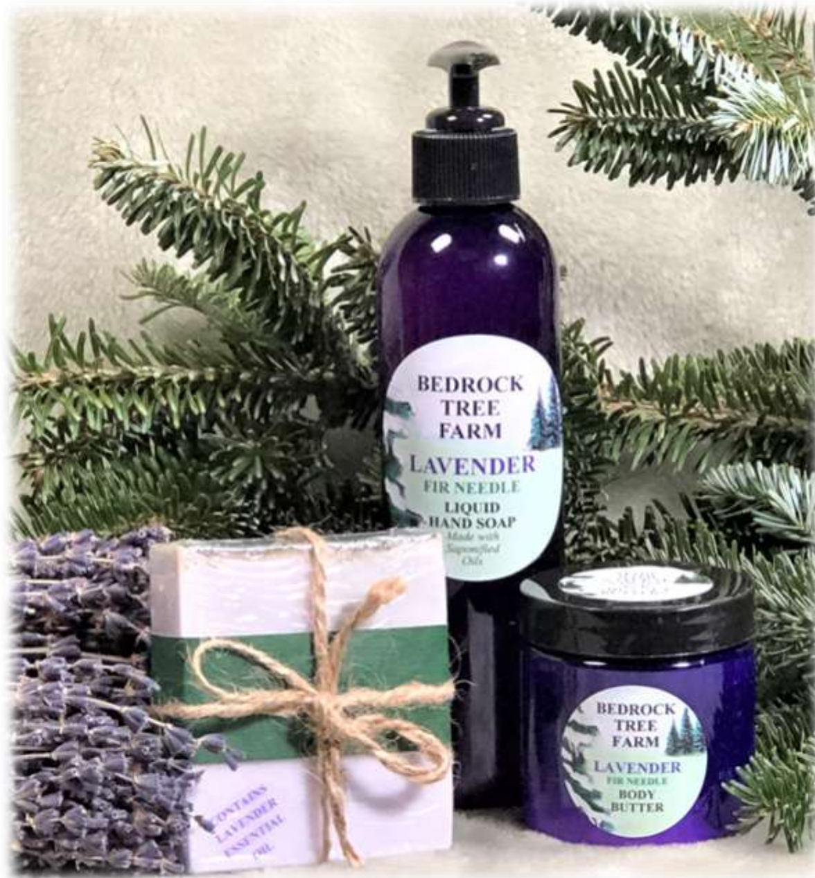
Wrapped Soap, Liquid Hand Soap, Body Butter, Body Wash

By popular demand we are now offering some of our most popular body care products with added Lavender Essential oil. Immerse yourself in your lavender dream, think of a touch of the fresh outdoors and you have a Lavender Lover's best ever product.