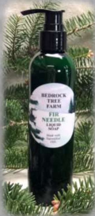
CLS8 - 8 oz.

It is made with naturally saponified vegetable oils and a high level of glycerine added with no sulfates, surfactants or detergents. It is mild to the skin with great natural cleaning power.