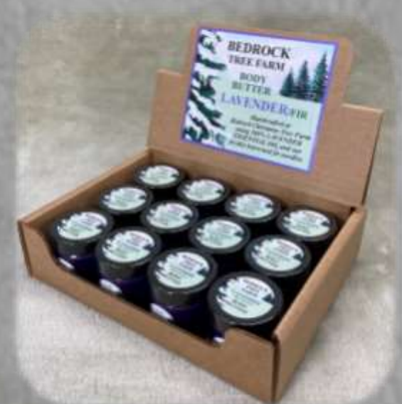
LAVENDER/FIR CBB2LAV12—Pop-up Display 12 ct. 2 oz. each