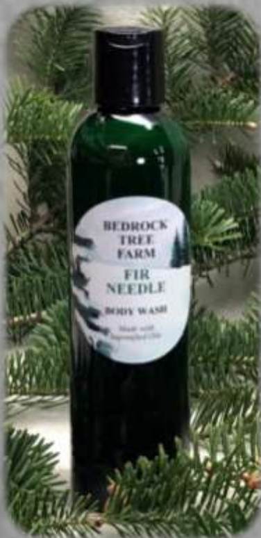
CBW8 - 8 oz.