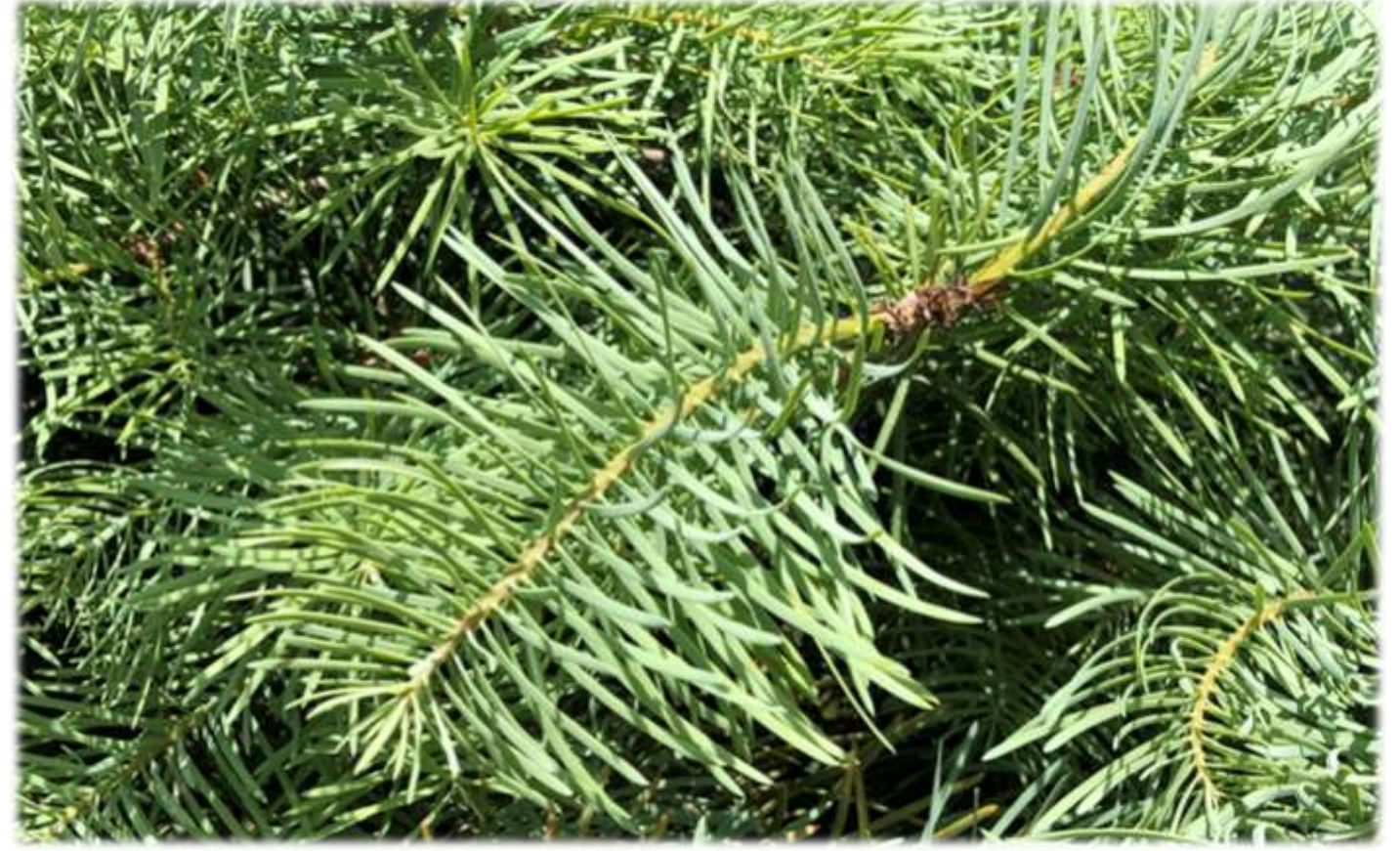
CONCOLOR FIR (White Fir)

The scent of the Concolor Fir needles is a very potent lemongrass scent and the Fraser Fir Needles add the apple note.