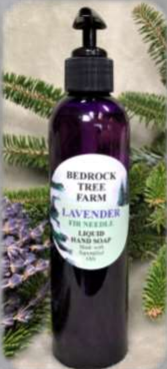
CLS8LAV - 8 oz.

Ingredients: Purified Water, Potassium Hydroxide, Glycerine, Cocos nucifera (Coconut) Oil, Olea europaea L (Olive Oil), Lavandula Angustifolia (Lavender Essential Oil), Abies Balsamea (Fir) Oil, Abies Balsamea (Fir) Powder, Naturally Derived Fragrance, Oleic Acid