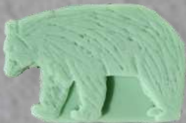
BEAR 2.5 oz.