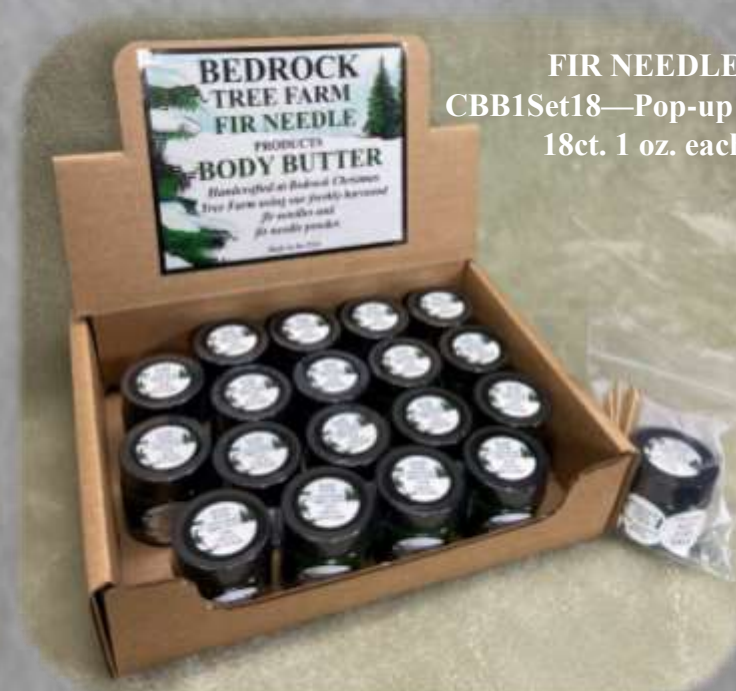
FIR NEEDLE CBB1Set18—Pop-up Display 18ct. 1 oz. each

It also contains Shea Butter and Cocoa Butter, which have historical benefits to the skin. Also includes Vitamin E and Japanese Green Tea. This cream is suited for the body, but many use it on the face, especially men after shaving. Believe it or not, guys do like lavender.