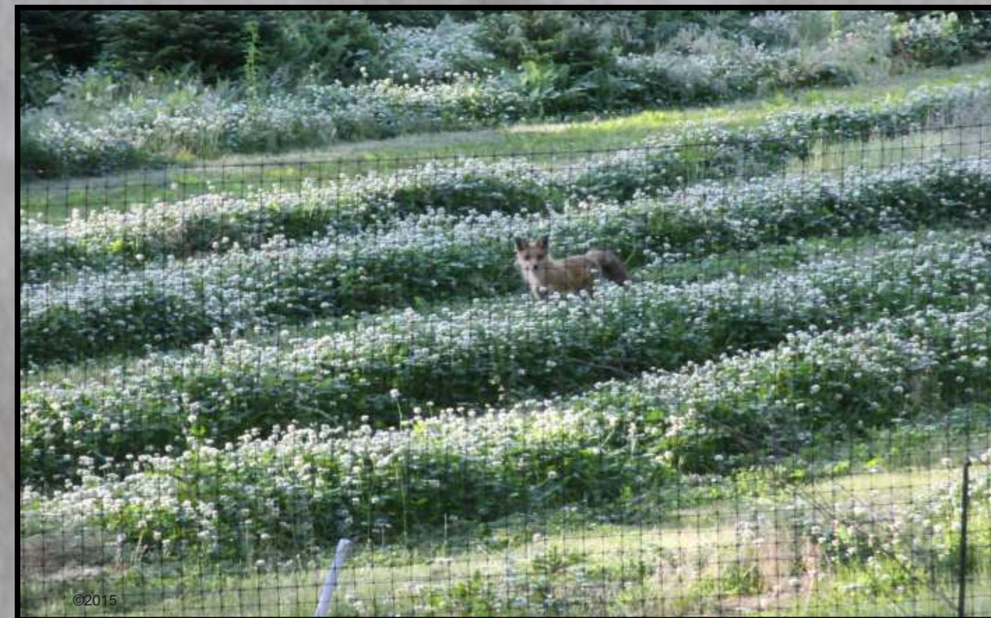
We strive to be a “good bee” pollinator friendly farm by planting acres of white clover among our trees.

(No, none of the foxes in this catalog are photo shopped in or retouched.)