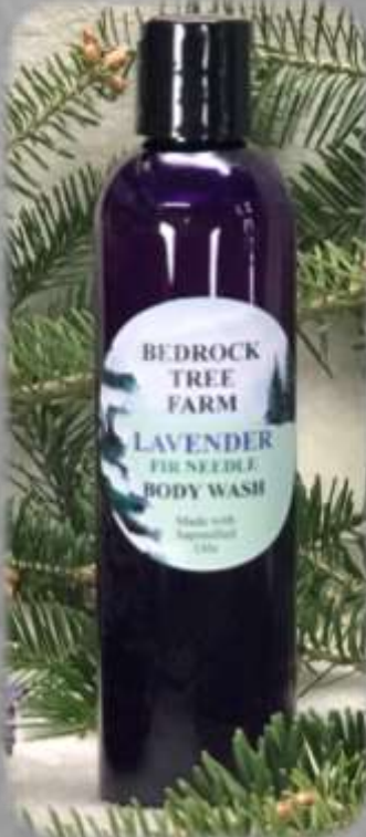
CBW8LAV - 8 oz.

Ingredients: Purified Water, Potassium Hydroxide, Glycerine, Cocos nucifera (Coconut) Oil, Olea europaea L (Olive Oil), Lavandula Angustifolia (Lavender Essential Oil), Abies Balsamea (Fir) Oil, Abies Balsamea (Fir) Powder, Naturally Derived Fragrance, Oleic Acid