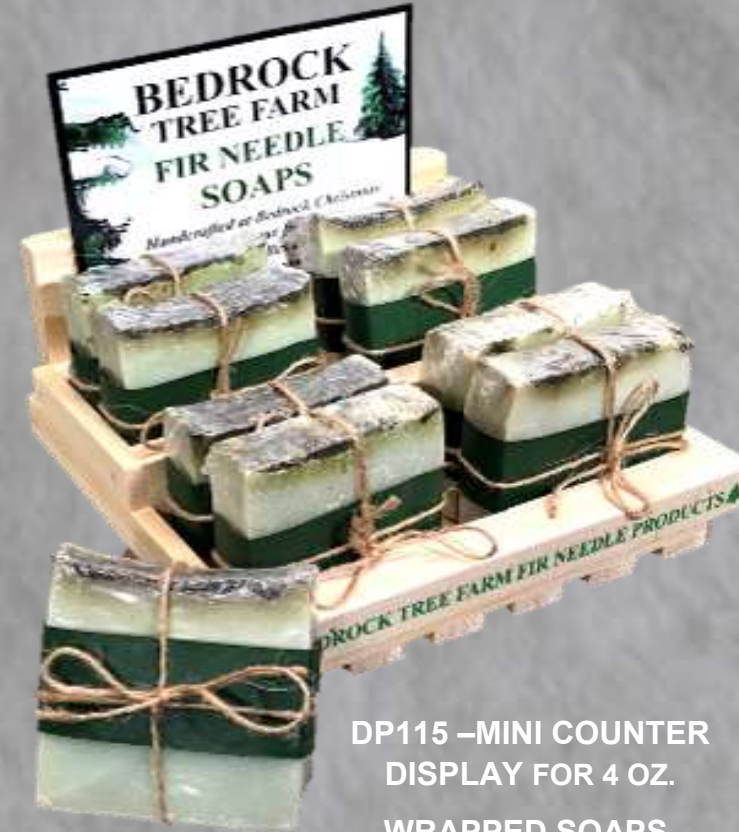
DP115 –MINI COUNTER DISPLAY FOR 4 OZ. WRAPPED SOAPS. 7 1/2"W x 7"D x 4 1/2"H

Our natural soap cut in squares, shrink-wrapped, paper wrapped and twine tied for a decorative presentation. Great in gift baskets.