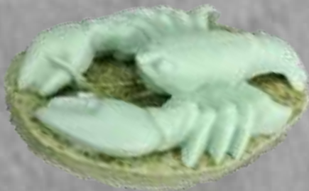
LOBSTER106 2.5 oz

Sold in sets of 12 in display only. Lobster also available in a wooden lobster trap display (priced separately)