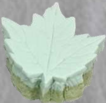
LEAF116 2.5 oz.

This 12 ct. soap set display is also available in the Fir Tree shaped Hemp soap, the lobster, maple leaf, and bear shaped shea butter soaps.