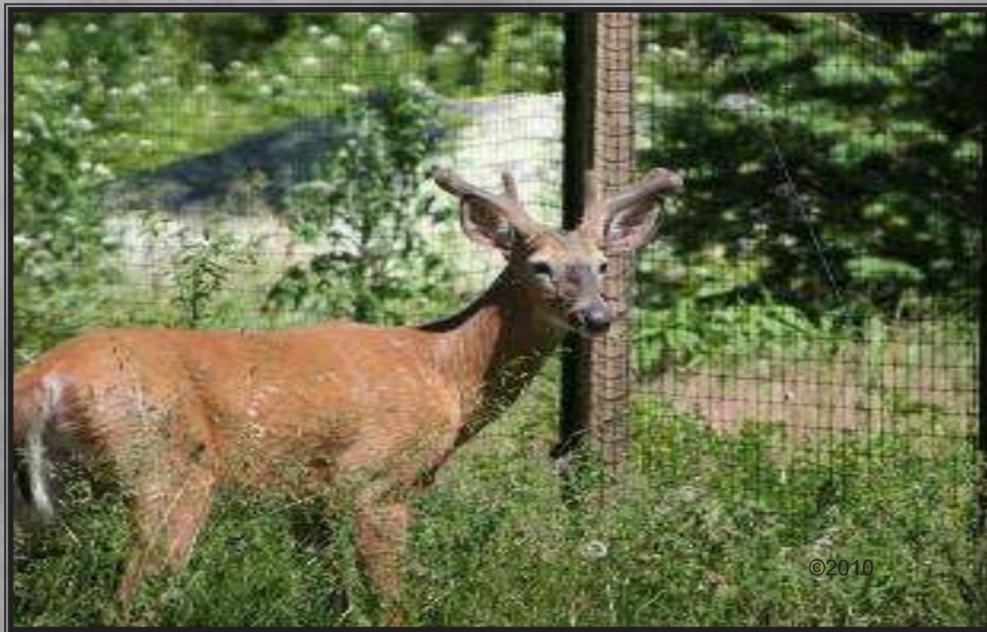
To save our crop from devastation we installed a protective deer fence around the entire perimeter of our Christmas Tree fields. Fir tree buds are like candy to browsing deer.