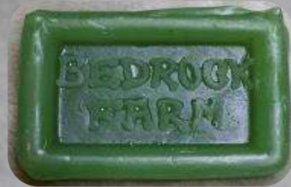
BEDROCK BAR BB101Hemp