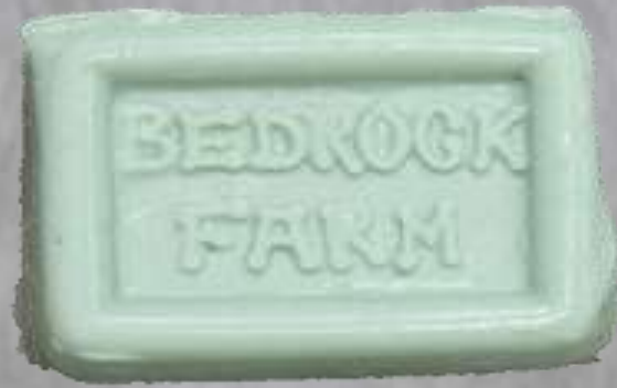
BEDROCK BAR BB100Shea